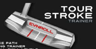
TOUR STROKE TRAINER

STROKE PATH PUTTING TRAINER FOR ALL SKILL LEVELS