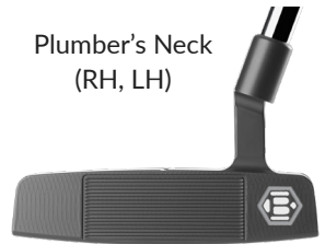
Plumber's Neck (RH, LH)