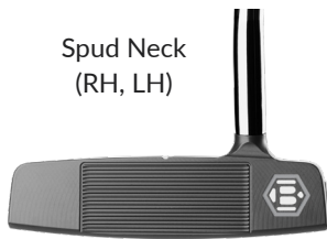
Spud Neck (RH, LH)