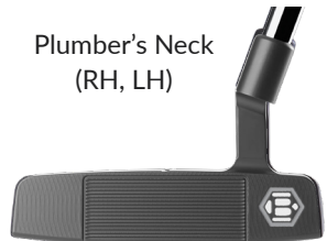
Plumber's Neck (RH, LH)