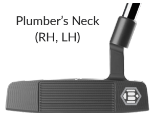
Plumber's Neck (RH, LH)